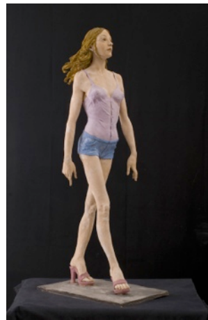
Marco Cornini Con quella sua camminata sicura terracotta sculpture 106 x 46 x 30 cm