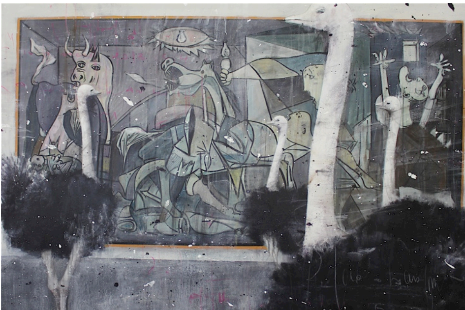
Angelo Accardi Misplaced oil on canvas 100 x 150 cm